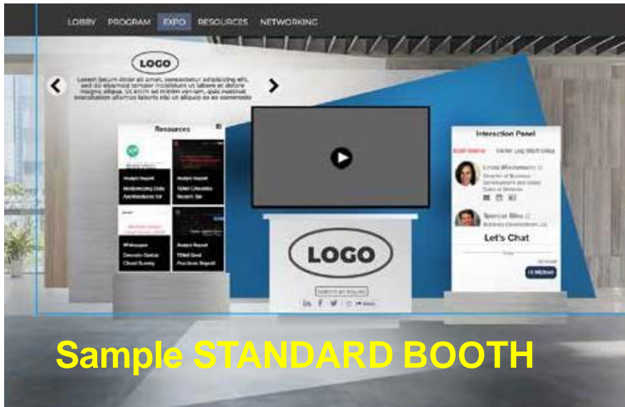
Sample STANDARD BOOTH