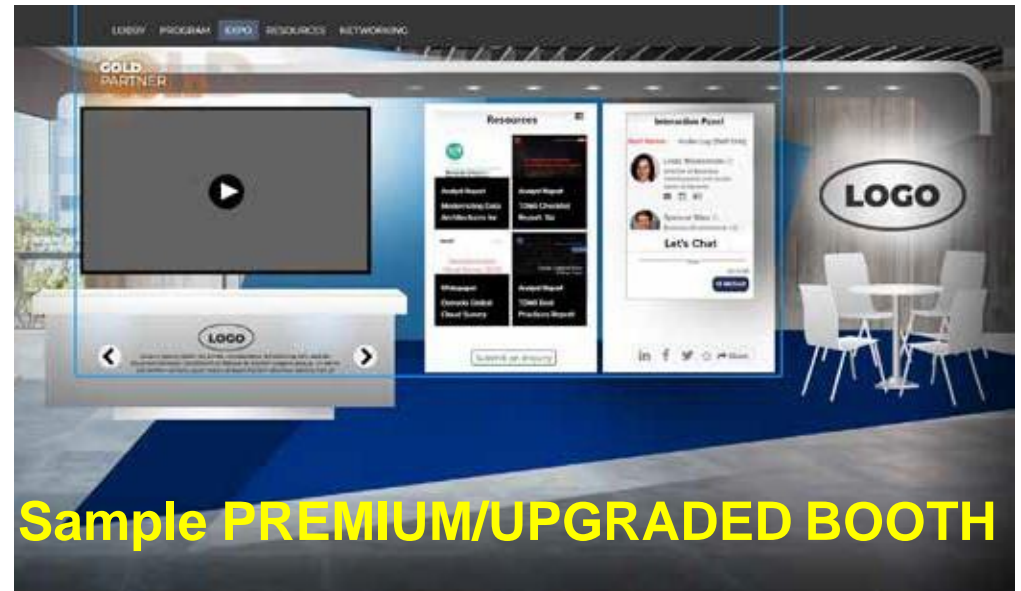
Sample PREMIUM/UPGRADED BOOTH