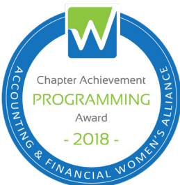
MESA EAST VALLEY